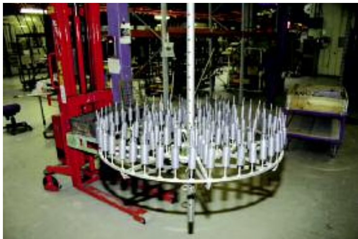
Accoat mainly uses polytetrafluoroethylene (PTFE), which is also known as Teflon, as coating material

Polytetrafluoroethylene (PTFE) is a synthetic fluoropolymer which is also known as Teflon. Discovered by DuPont in 1938, it is used as a non-stick coating for pans and other cookware. Yet, PTFE has many other applications, too: it is often used in containers and pipework for reactive and corrosive chemicals and, as a lubricant, significantly reduces friction, wear and energy consumption of machinery. One of the leading European processors of this highly versatile material is Accoat A/S. The Danish company specialises in high-quality surface coatings – for everything from tiny devices to large, heavy-duty equipment.